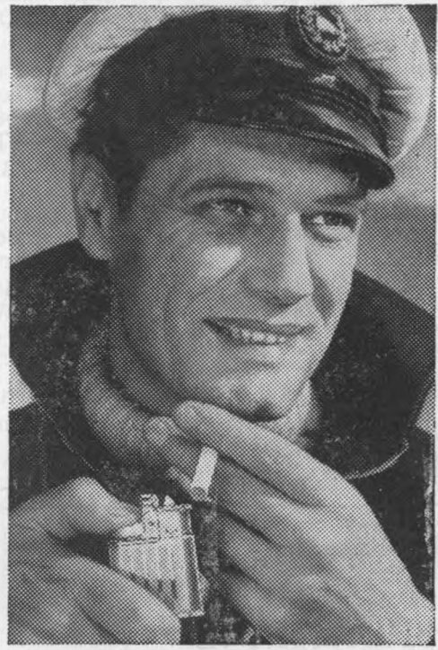
Shield up for outdoors — down for indoors