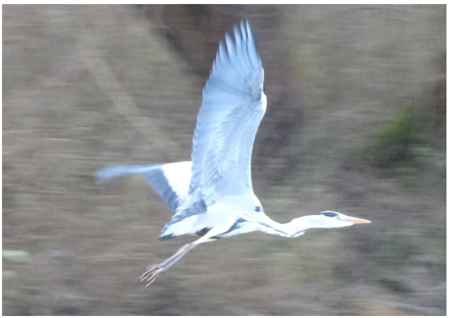
Above: Heron over the River Mole. Below: A swan, the town's own symbol, spreads its wings.

In the last few years the birds and beasts to be seen when walking by the river in Leatherhead have changed.