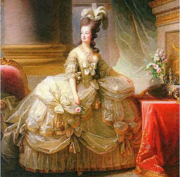
18th century people Above: In the 18th century women at court bought teeth extracted would wear gigantic and heavy hoops under from corpses to fill their dresses, add disease-carrving materials to their hair, and poison their skins with Dentures came later toxic chemicals. All to appear wealthy actually rather than necessarily beautiful.

late as the 1950s when they charged for unnecessary extractions rather than working to save natural teeth as they do today.