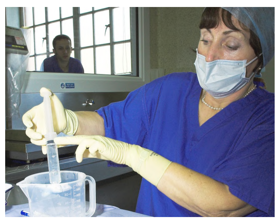
Above: Working on nasal washings in the mortuary.

is one technique that has been borrowed by archaeology. It has transformed how we view ancient communities.