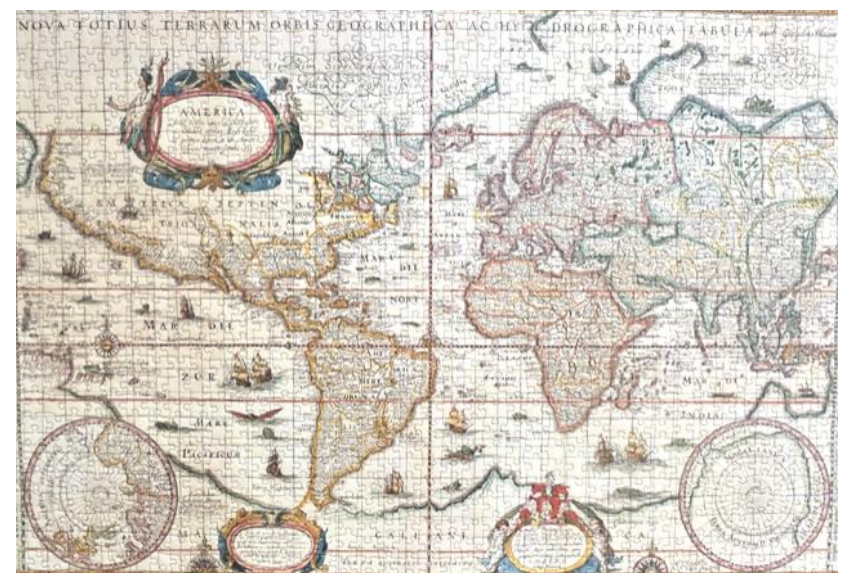
Above: A map of the world as known in Europe in 1650, long before the age of technological surveys.

Once the position of some primary points are known, measure from them to points in between and so on.