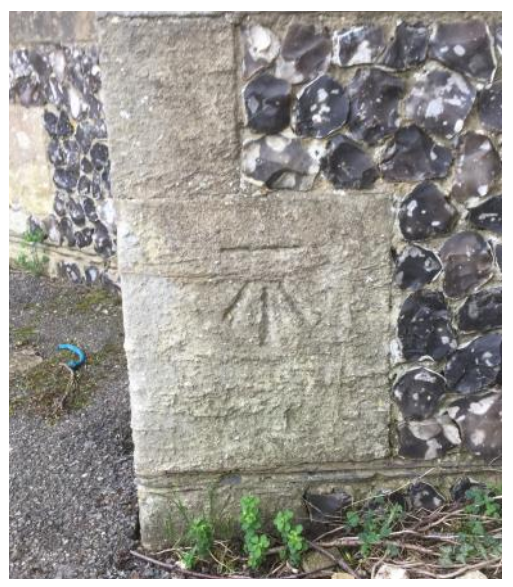
Above: Benchmark on the west wall of Leatherhead Parish Church.

This network of physical markers is a monument to a huge project run over two centuries to map the country and which we now take for granted.