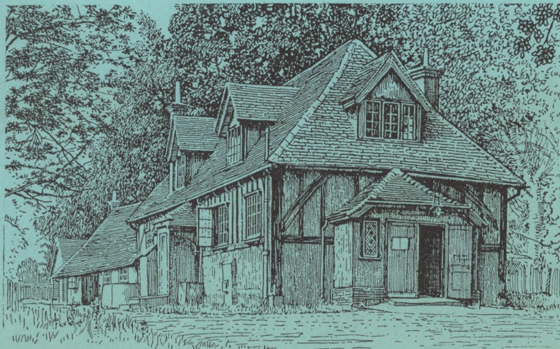
THE OLD BARN HALL THE BOOKHAM COMMUNITY ASSOCIATION CENTRE.