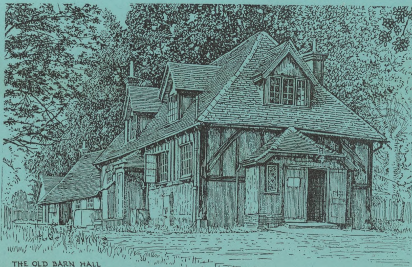
THE OLD BARN HALL THE BOOKHAM COMMUNITY ASSOCIATION CENTRE.