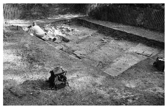
suggested the possible location of View of Trench 9 from the southwest at end of excavation (a work in progress). From right to left: burnt top of natural clay with tile feature; burnt rubble area partially excavated down to blue-grey clay; southern edge of line of central flue; partially excavated flue; northern side of central flue; partially was clear that the trench was in an excavated area with another tile feature and nearer to area where there had been a great the camera possibly a surviving part of the eastern end

Analysis of magnetometer survey by Archaeology South-East in 2008 one or more tile kilns near the western edge of the main quarry, and this new trench was opened to test these results. From early on it deal of burning, but it was possible of kiln proper. to find only a thick layer of burnt