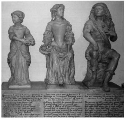
Marble statues of the Atkins children now in St Paul's Church, Clapham

building....built in an age when church architecture had reached its lowest depth".