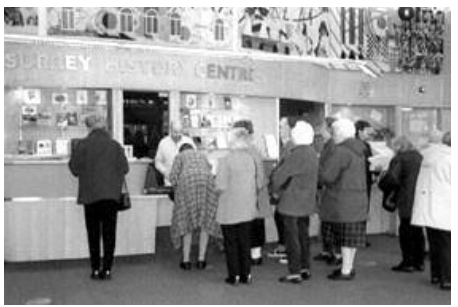
Surrey History Centre Reception

Located in Woking, this striking new building was opened in 1999. Specially designed for its intended function it houses a vast archive of documents which are available for inspection by any interested person, be they researchers, historians or ordinary members of the public. At the front there are exhibition areas, lecture rooms, a reading room and a shop, but the central feature is the vast strong room where thousands of