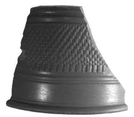
Fragment of samian cup

Work in the second trench could not be completed in the time available and it will