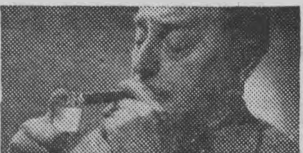
3 A stickler for the good things of life! Ronson is quite naturally his choice in lighters.