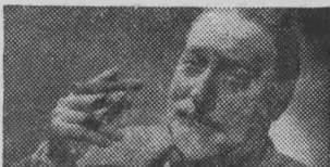
2 Sea-soldier... British agent... lover of little islands... famous author... he now pens 'Eastern Epic'.