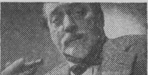
4 His rule for success? Believe passionately in what you do and never spare your effort.

The Ronson Standard, from 38/6, is seen below. Imagine this as a gift from you or to you . The most successful gift is a Ronson, jewellery finished, precision built. There are over 60 designs including table lighters... a Ronson to suit every personality and every home!