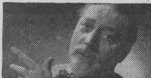
1 Great Scot, bravely-bearded Compton Mackenzie admits devotion to gramophones and Siamese cats.