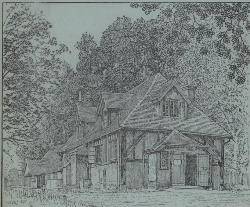
THE OLD BARN HALL THE BOOKHAM COMMUNITY ASSOCIATION CENTRE.