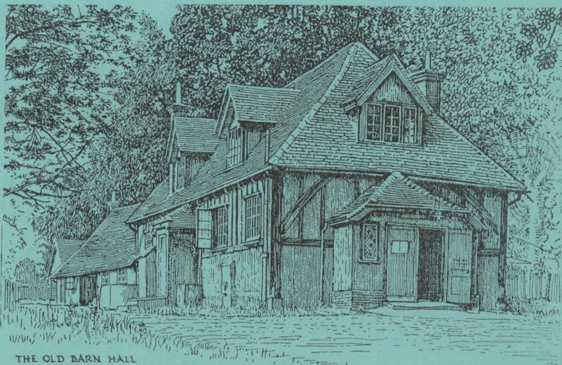
THE OLD BARN HALL