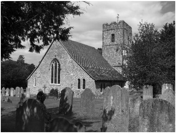
St Mary's Church, Fetcham

We are photographing the bound volume of the monumental inscriptions and layout of the churchyard given to St Mary's Church, Fetcham by Fetcham WI in the late 1980's.. This will be transcribed onto our database of the census returns from 1841 to 1901 for Fetcham. along with the record linkage we have carried out with the births, marriages and deaths from the Parish records