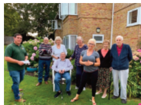
Congratulations, and well-done