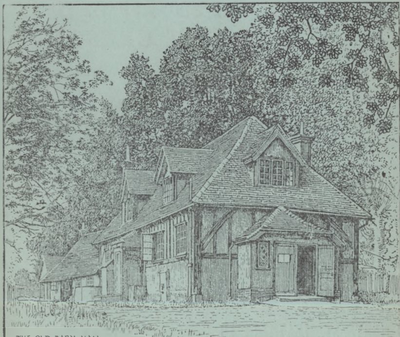
THE OLD BARN HALL THE BOOKHAM COMMUNITY ASSOCIATION CENTRE.