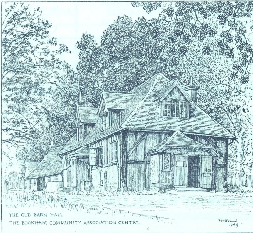
THE OLD BARN HALL THE BOOKHAM COMMUNITY ASSOCIATION CENTRE.