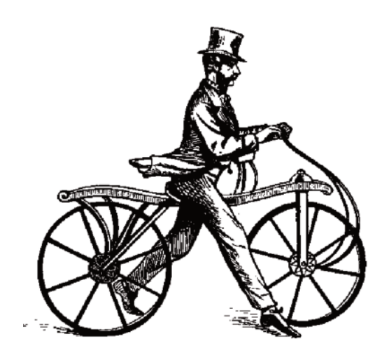
The Hobby Horse

shaker' bikes he had brought and showed early photos of Bolder Mere near Wisley depicting these bicycles and their riders.