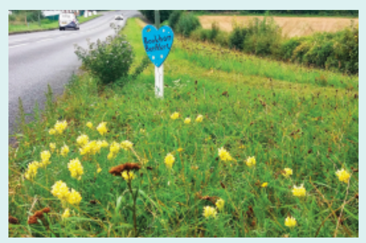
Toad flax north side verge east of Rectory Lane

The team (Diane & Steve Poole and Frances Fancourt) behind the Bookham Blue Hearts now have a Facebook page @bookhambluehearts which you can like/follow and can also be contacted at bookhambluehearts@gmail.com or by leaving a message on 0300 030 9890. We're happy to advise on how to make and decorate your own hearts.