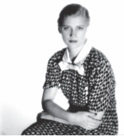
'Self portrait, Lee Miller Studios, Inc., New York, USA 1932' by Lee Miller

Members will be kept informed but all will depend on how the virus and any government response affects distancing and social contact.