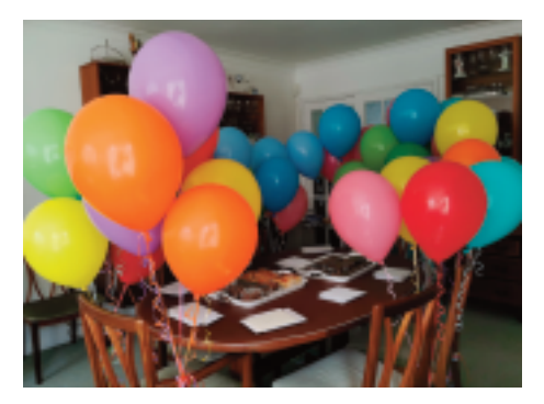
Birthday cake and balloons ready for dispatch