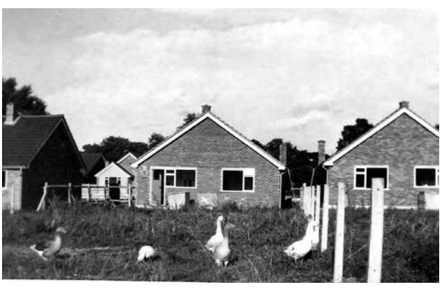
Ducks left over from the old Sole Farm as the estate was being built

£3,435 doesn't sound a lot nowadays - that for a three bedroom bungalow! The current going price is something like 150 times as much! What can you buy for £3,000 nowadays?