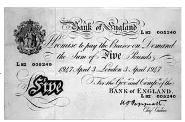
1957 £5 note - 81/4" x 51/4"

1957 sounds a long time after WWII but it was still a time of austerity. It was only a few years after food rationing had eventually ended and you no longer needed your coupon books. National Service was still compulsory and all school leavers still had to do two