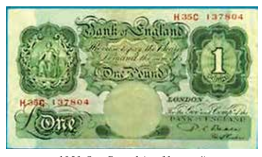
1950 One Pound (no £1 coins!)

All this didn't last long and a computing firm offered the absolutely fantastic salary of £1,000 a year. It doesn't sound anything now but in those days it was a fortune - rich at last! Of course this meant moving and this time to the Potteries area. It was a delightful