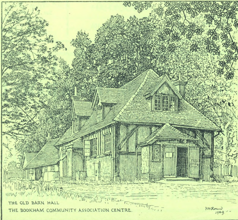
THE OLD BARN HALL THE BOOKHAM COMMUNITY ASSOCIATION CENTRE.