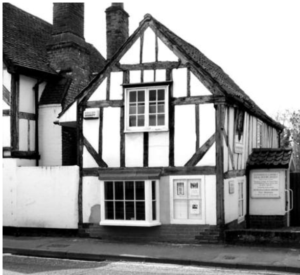
The museum with its new bay window

Work is well under way to restore the museum after the damage caused by the car crash which wrecked the front of the building last January. The museum normally reopens for the season at the start of April but this will not now be until May or even June depending on the rate of progress with the restoration.