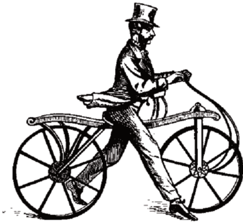
The Hobby Horse

Talbot in Ripley. By now the High Bicycle or Penny Farthing with its huge front wheel was being produced and in 1882 L Cortis of Streatham rode a 60 inch wheeled bike with 60 spokes at 20 mph at Crystal Palace, the event being commemorated with a memorial in Ripley church.