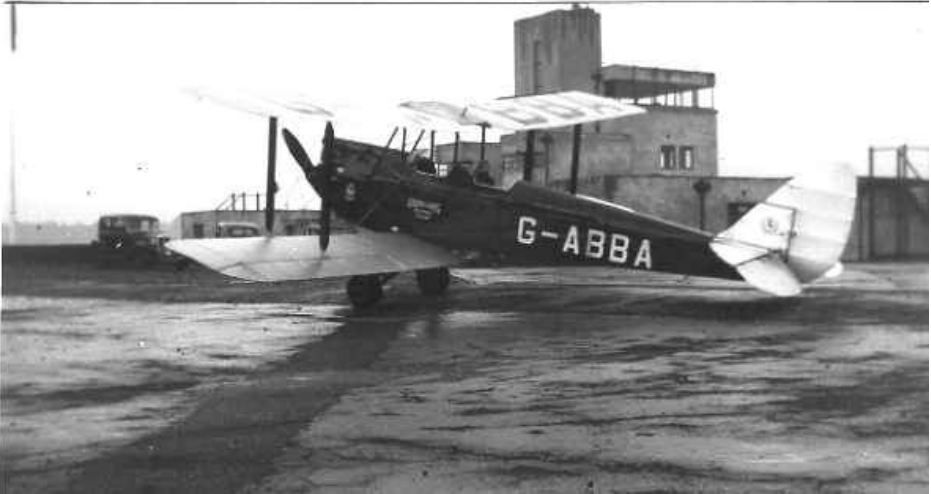
DH60 Moth at Brooklands