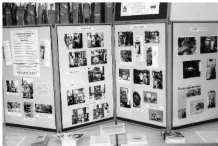
Display at Surrey Symposium

On Saturday 25th October I attended the Surrey Local History Symposium at Chertsey. Our history society joined with other history societies to listen to a programme of talks, making our contribution to the start of the 90th anniversary celebration with the title of 'Surrey and The First World War'. The range of subjects were diverse and interesting ranging from 'Aircraft Production in Surrey in World War I' and the 'Frith Hill Prisoner of War Camp' to talks on 'The Royal British Legion Poppy Factory' at Richmond and