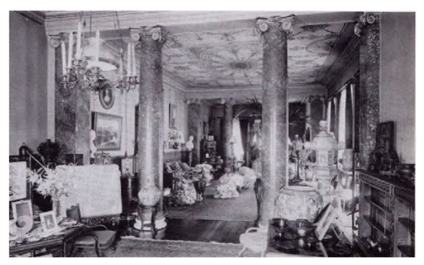
Drawing Room at Eastwick Park from the west end c1890.

golf course. It is said he never really acclimatised to the south and went to live in Scotland.