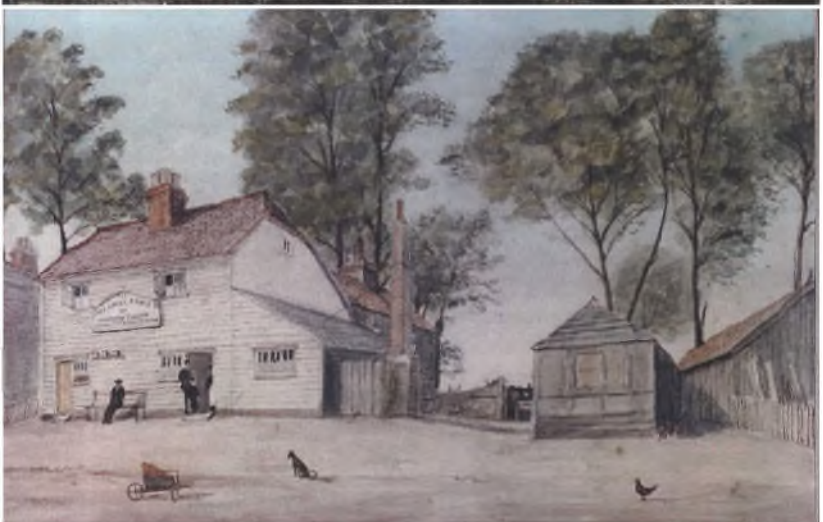
Top: The original Duke's Head in Leatherhead High Street. Above: The Railway Arms in Kingston Road, Leatherhead, was finally demolished in 2001.