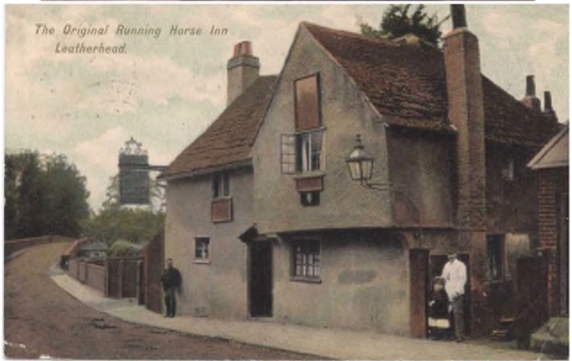
Top: The long lost Swan Hotel. Above: The Running Horse.

As well as its pubs Leatherhead also had two breweries. The owner of the Swan Hotel established the Swan Brewery in 1874 and it continued until 1921. The Lion Brewery was started in North Street in the late 18th century by Thomas Cooper but had finished brewing by 1892. It was then used as a malting house only.