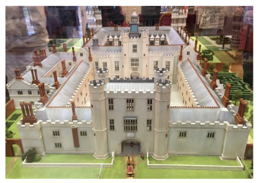
Above: Model of Nonsuch Palace, Cheam, in the days of King Henry VIII. Below: Friends of Leatherhead Museum gather outside the mansion during the visit in March.